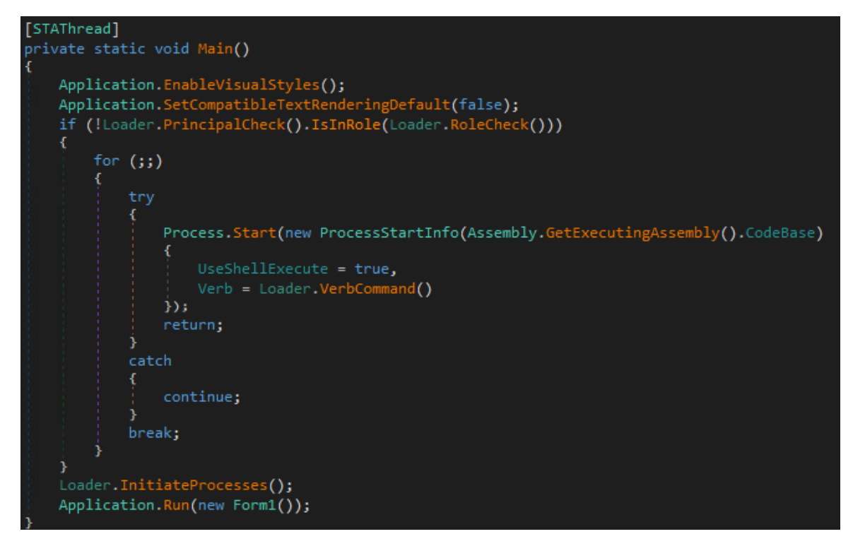
Overview of the dropper responsible for HomuWitch ransomware

HomuWitch is a ransomware written in C# .NET. Its name comes from the file version information of the binary. Victims are usually infected via a SmokeLoader backdoor, masked as pirated software, which later installs a malicious dropper that executes the HomuWitch ransomware. Cases of infection are primarily found in two locations – Poland and Indonesia.